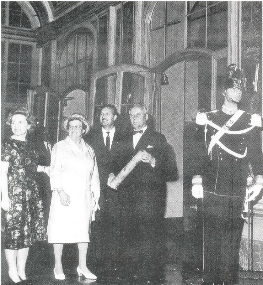
Ragnar Granit receiving the St. Vincent Prize at Accademia di Medicina, Torino, 1961.

His scientific awards include, amongst others, the Anders Jahren Prize for medicine in the Nordic Countries in 1961, the Accademiadi Medicina (Turin) St. Vincent Prize in 1961 and of course the already mentioned Nobel Prize, which crowned his scientific career in 1967.