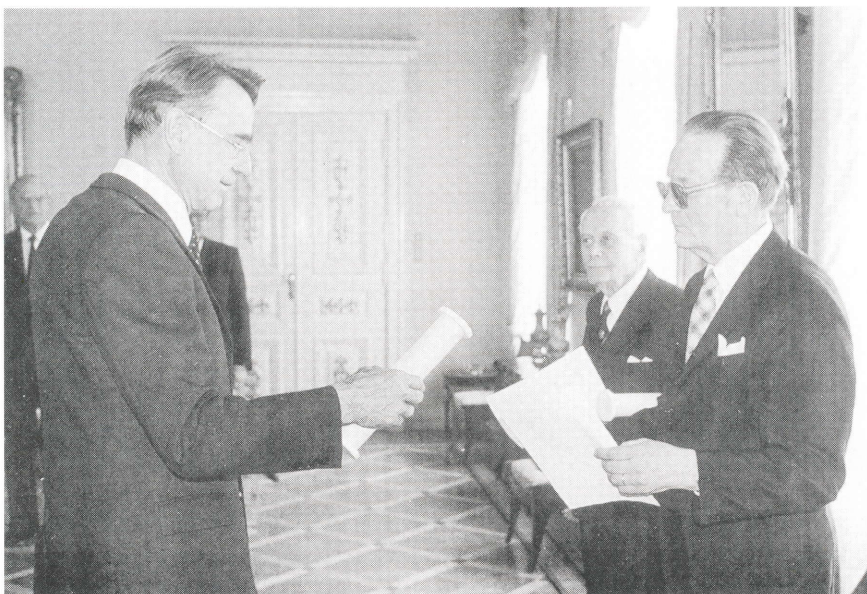
Ragnar Granit and Matti Kuusi receive the honorary degree of Academician from President of the Republic of Finland, Mauno Koivisto in 1985.

Ragnar Granit was also Visiting Professor at the Rockefeller Institute in New York during the years 1956-1966, at St. Catherine's College, Oxford in 1967, at the University of the Pacific, San Francisco in 1969, at the University of Düsseldorf in 1975, at the Max-Planck Institute (Bad Nauheim) in 1976 and at the National Institute of Health (Bethesda, Maryland, USA) in 1971-1972 and 1974.