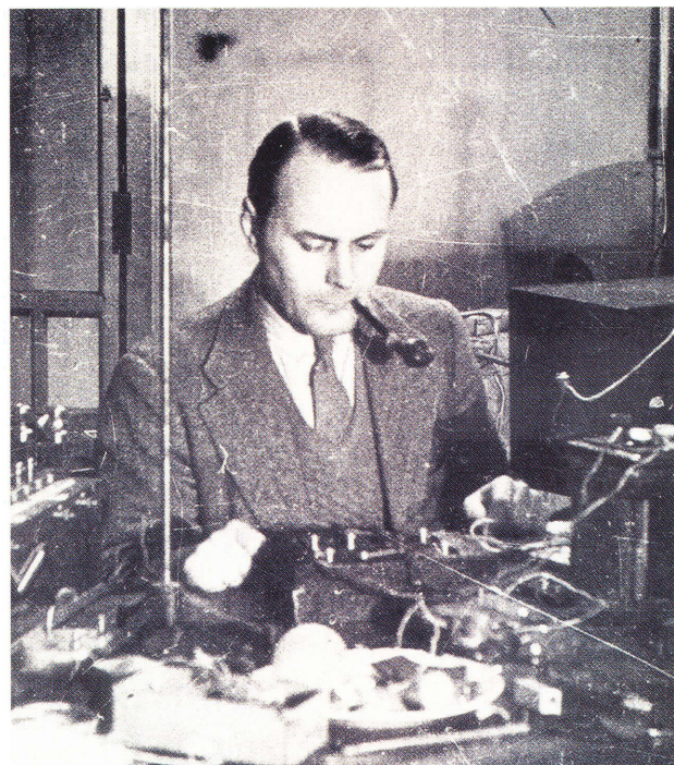
Ragnar Granit at Helsinki University, Institute of Physiology in the early 1930's.

Using the electric measuring technique developed by Edgar Adrian, Granit continued bioelectric research at the University of Pennsylvania as researcher in medical physics from 1929 to 1932. After that he was back again at Sherrington's laboratory during the years 1932-1933. He continued his bioelectric research on the visual nerve and the retina, called electroretinogram (ERG), at the University of Helsinki from 1935 to 1940. Granit's book Sensory Mechanisms of the Retina published in 1947 is one of the classics in the field of the electrophysiology of the eye.