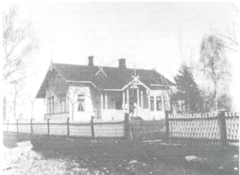
Ragnar Granit's childhood home at Oulunkylä, suburb of Helsinki