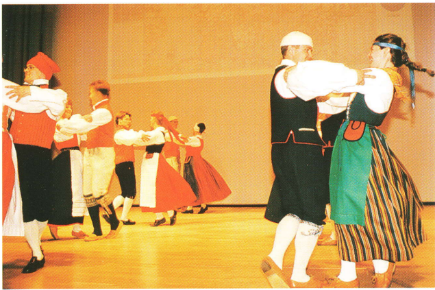
Traditional Finnish folk dancing at the Opening Ceremony.