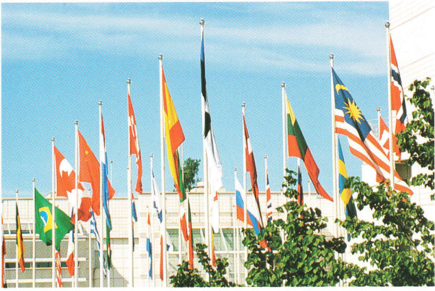
The conference participants came from 36 countries.